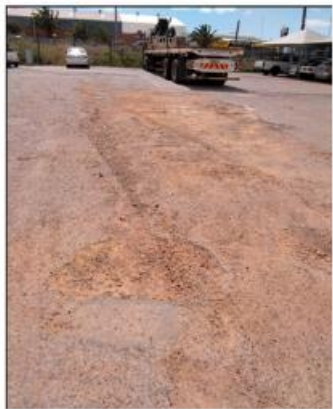
POTHLES: SAXONBERG ROAD