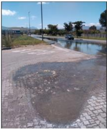
BLOCKED OVERFLOW SEWER: BUTTSKOP ROAD BLACKHEATH