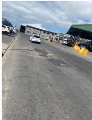
POTHLES: TRAFORD ROAD