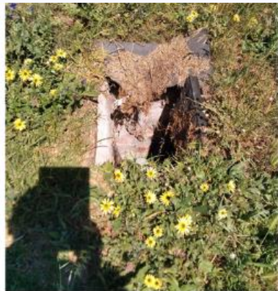
DAMAGED MANHOLE COVER: BUTTSKOP ROAD