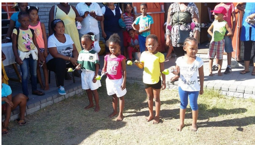
Sports day activity

Sing for Africa Happy Valley had an athletic event on Saturday 12 March and had a day outing on the 16th March to Sea Point Park. A big thank you to the parents for their support, teachers staff and governing body members for all their hard work and attendance.