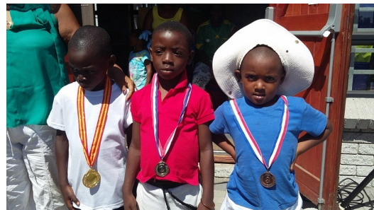
A few of the winners