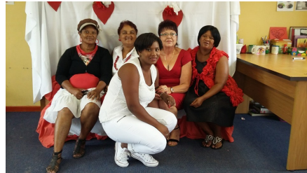
Students Celebrate Valentines Day

©2017 Blackheath City Improvement District | Neulux Logistics, 21 – 23 Wimbledon Road, Blackheath, 7580