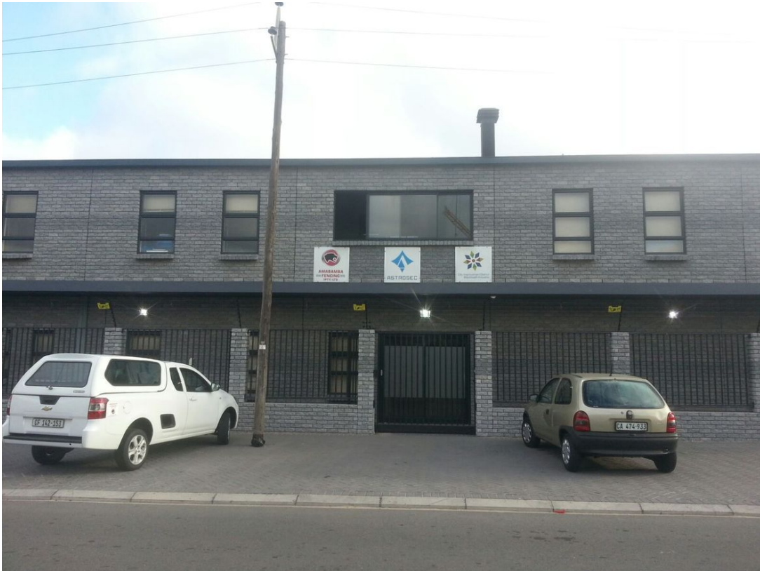
Our previous offices at the Astrosec Building in Heath Street in Blackheath.