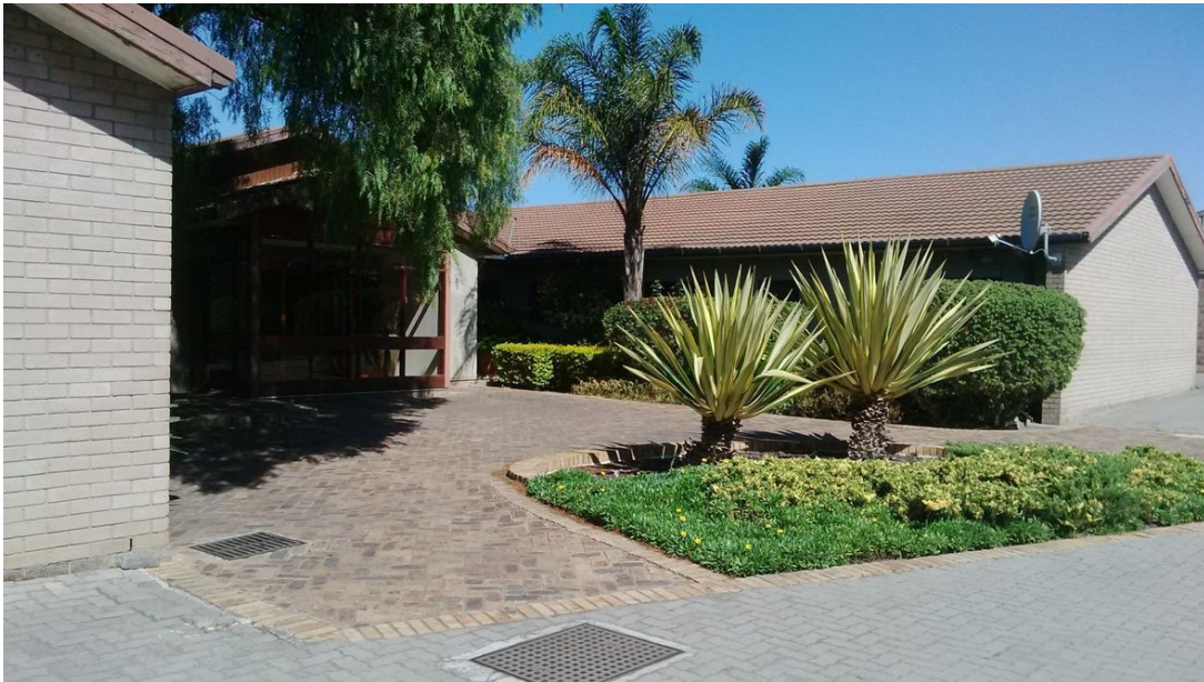
Our new office location at Neulux Logistics in Wimbledon Road