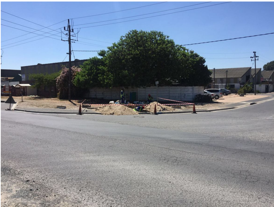
Constant telecoms infrastructure upgrades are being seen in and around Blackheath Industria

Road works took place on Wimbledon and Metal Road.